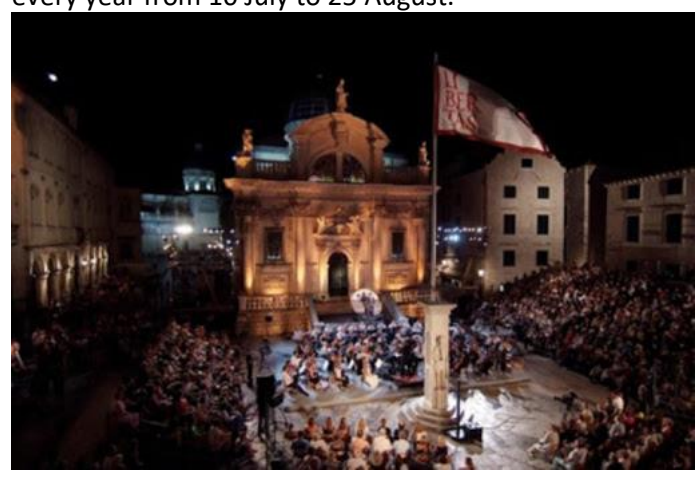
AUGUST 2024 ŠIPAN SUMMER FILM SCHOOL

Dubrovnik Summer Festival is undoubtedly the largest and most representative cultural manifestation, not only in Dubrovnik, but in all of Croatia. It is held since 1950 and lasts every year from 10 July to 25 August.