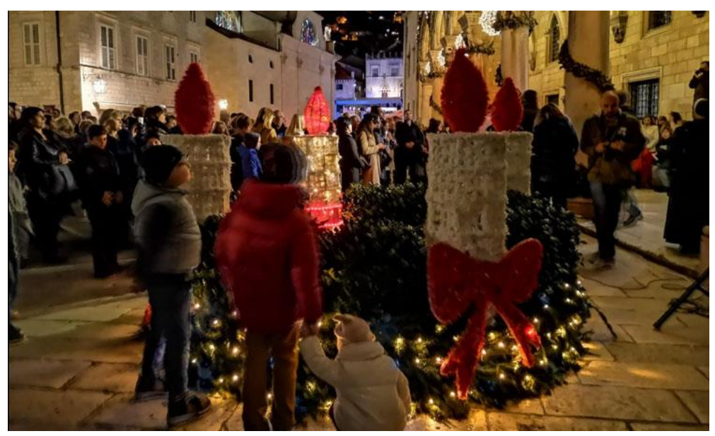
31. December NEW YEAR'S EVE www.tzdubrovnik.hr

Dubrovnik's many visitors will bring in New Year's 2025 while entertained by a spectacular music programme which will already begin in the morning hours of December 31st, New Year's Eve. The New Year's program includes a diverse, entertaining three-day program, in which everyone will find something interesting. The New Year will begin with the a concert of the Dubrovnik Symphony Orchestra, paired with oysters and champagne, beginning on New Year's Day at noon.