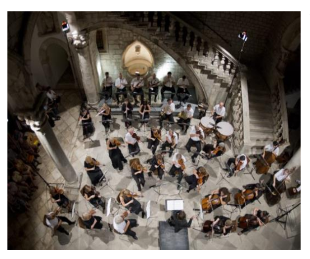
19. do 27. June 2024. International Opera Arias Festival "Tino Pattiera" <a href="https://www.dso.hr">www.dso.hr</a>

This Festival is named and organized in memory of the world-famous opera singer, tenor Tin Pattier, born in 1890 in Cavtat near Dubrovnik, where he died in 1966. Tino Pattier is a significant and famous name of European and world opera houses of the first half of the 20th century. He was the champion of the Royal Saxon Palace Opera in Dresden and Elan of the Berlin State Opera. Pattiera was a tenor with a specific voice who interpreted the lyrical and dramatic character of the most famous opera works by Meyerbeer, Tchaikovsky, Moussorgsky, Verdi Puccini, Wagner, Strauss, and many others. In addition, he sang with many internationally renowned singers on world