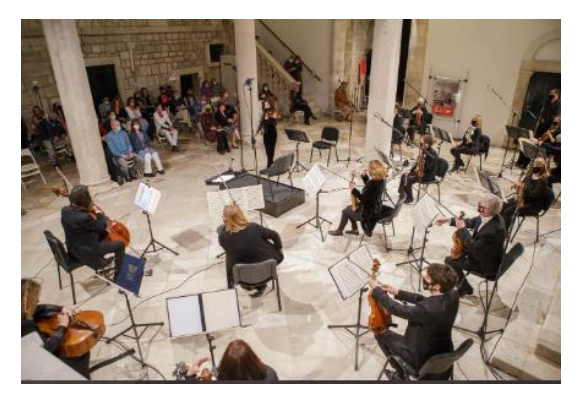
25. APRIL-.13. JUNE 2024 DUBROVNIK MUSICAL SPRING www.dso.hr

Although Dubrovnik is filled with cultural events throughout the year, most of the programs take place in the summer, during the high season. However, Dubrovnik Symphony Orchestra recognized the need for a quality music program, so in 2017 it introduced a music festival called the Dubrovnik Music Spring.