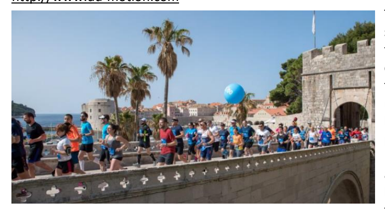
27 – 28 APRIL 2024 DUBROVNIK HALF MARATHON http://www.du-motion.com

The attractiveness of this new sporting event is based on the fact that Dubrovnik – the host city is part of the UNESCO's world Heritage. The terrain is very attractive for marathon running, especially 2K (two-kilometer long) race with a limited number of participants held at Dubrovnik walls, Dubrovnik's most important attraction. Half marathon route is 21.1 km long, starts at Ploče, passes through the Pile up till Kantafig in